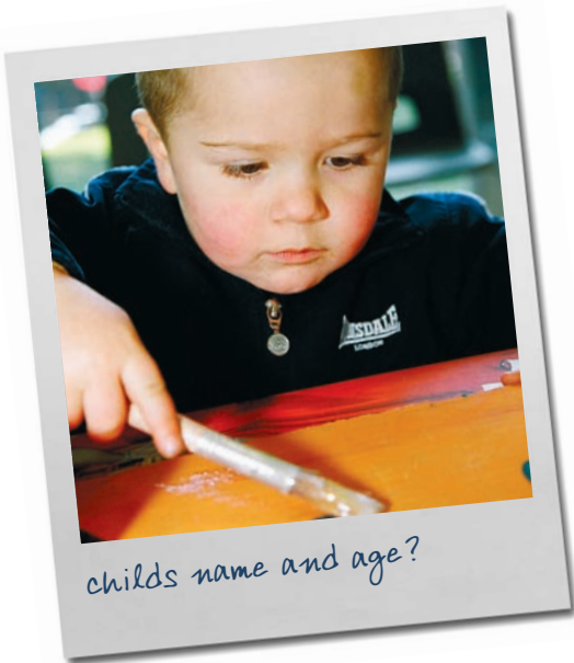
childs name and age?

We offer the children a broad and balanced curriculum which follows Birth to Three Matters and the curriculum guidance for the foundation stage.